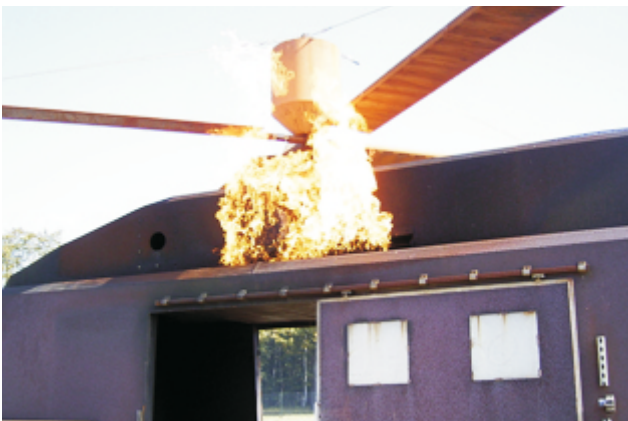
Helicopter Engine Fire