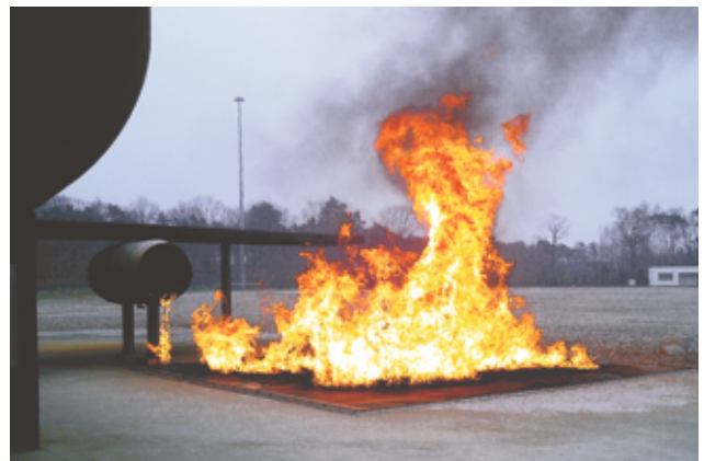
3D Fuel Spill