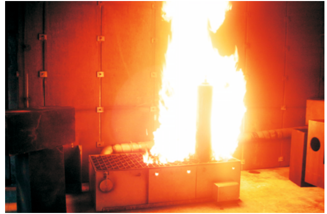
Gas Bottle Fire