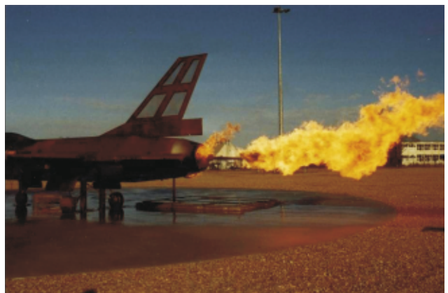
F-16 "Hot Flash" Fire