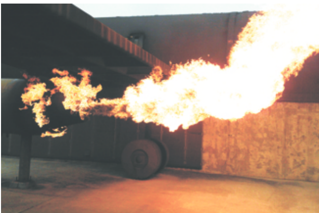
Jet Engine Fire with "Hot Flash"