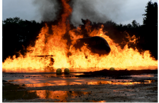
Active Fuel Spill Trainer