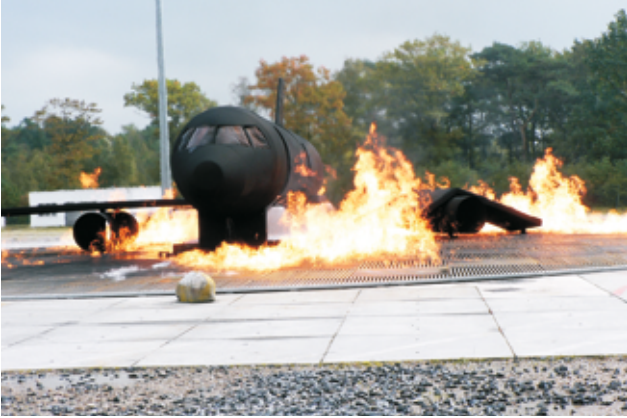
Fuel Spill Trainer: Passive Split Wing Aircraft Mock-Up