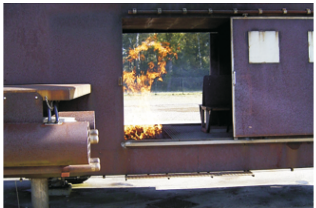
Helicopter Cabin Fire