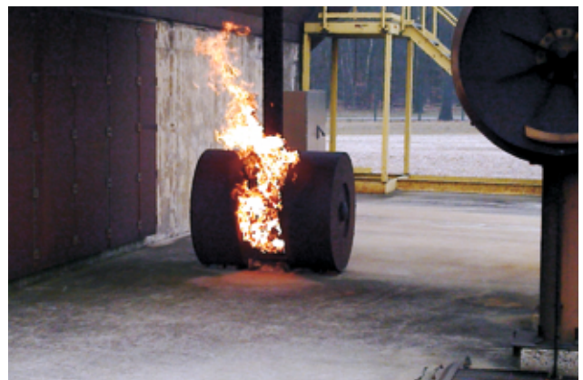
Undercarriage Fire (Brakes)