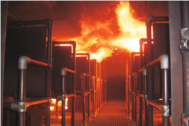
Overhead Luggage Fire