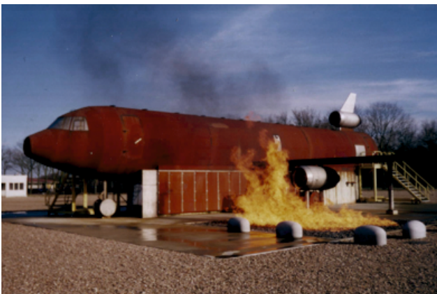
B737 Aircraft Trainer with Active Fuel Spill