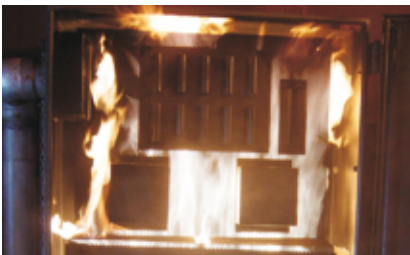
Electrical Panel Fire