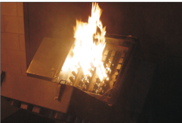
Radar Console Fire