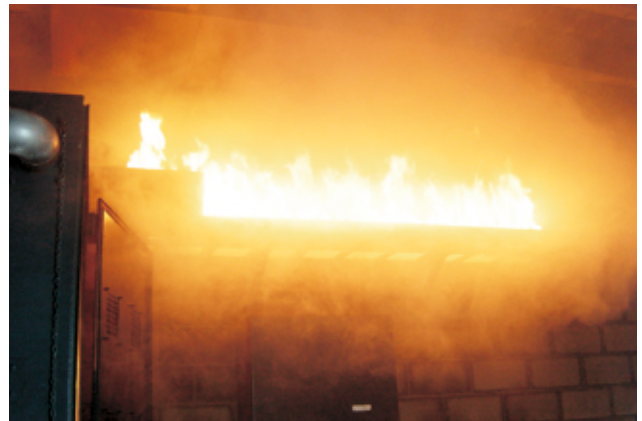
Cable Tray Fire