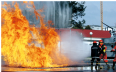
Deck Fire / Fuel Spill