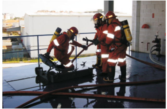
Entry Through Hatchway