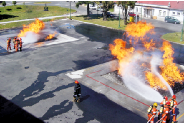
Both Fuel Spills Running At A Time