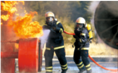
Wheel / Brake Fire