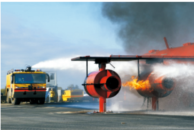
C-130 Jet Engine Fires (2x)