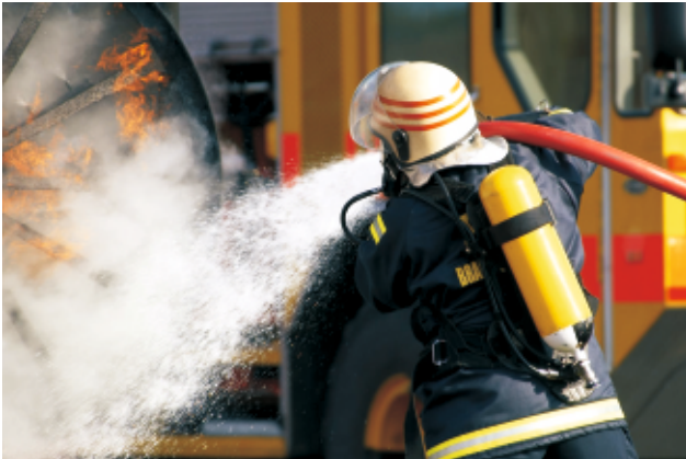
Exinction Training at Engine