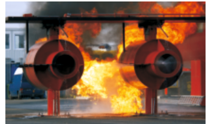
C-130 Jet Engine Multimode Fire