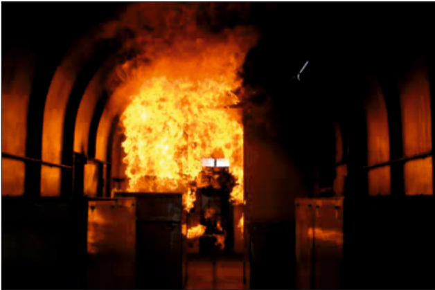
Passenger Compartment Fire With Flashover