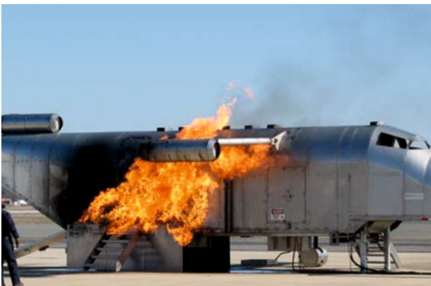
Starboard Fuselage Fire