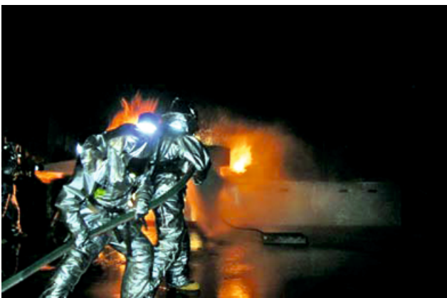
Night Training 2