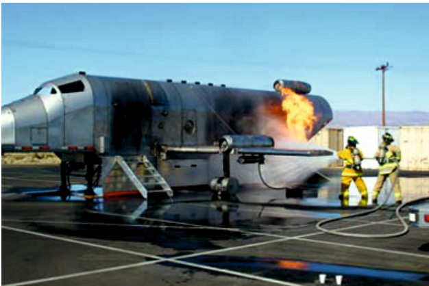
Port Engine Fire