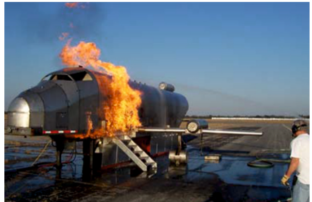
Port Fuselage Fire