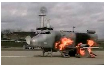
Port, Fuselage and Engine Fire