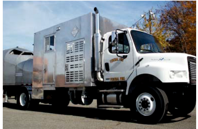
Tractor With Control Room and Propane Tanks