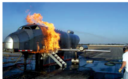
Port Fuselage Fire