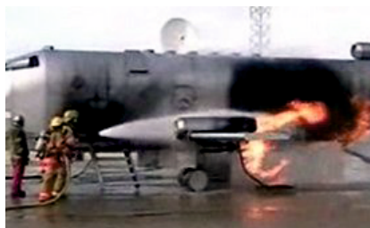
Running Low-wing Engine Fire With 3-D Fuel Spill Fire