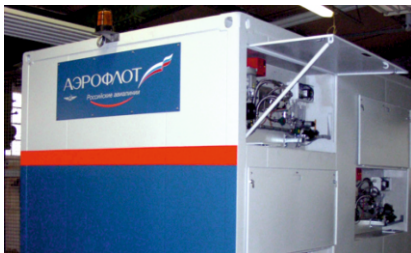
Container (Rear View)