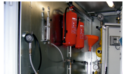
Filling Station for Extinguishers