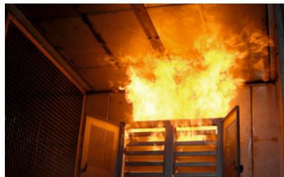
Galley Oven Fire