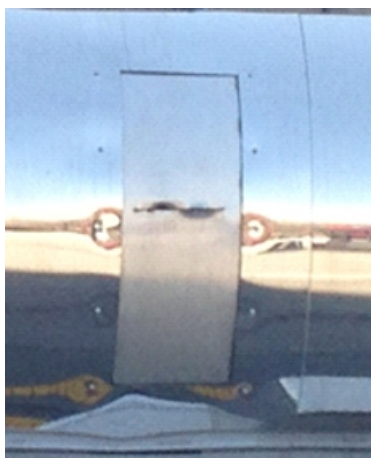
Rupture Simulation Panel