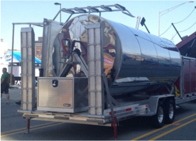
Trainer Backview with 90° rollover tank