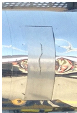
Rupture Simulation Panel

©KFT Fire Trainer | All rights reserved | Copying or reproduction in any medium is strictly prohibited. | KFT 20160422 01 EN