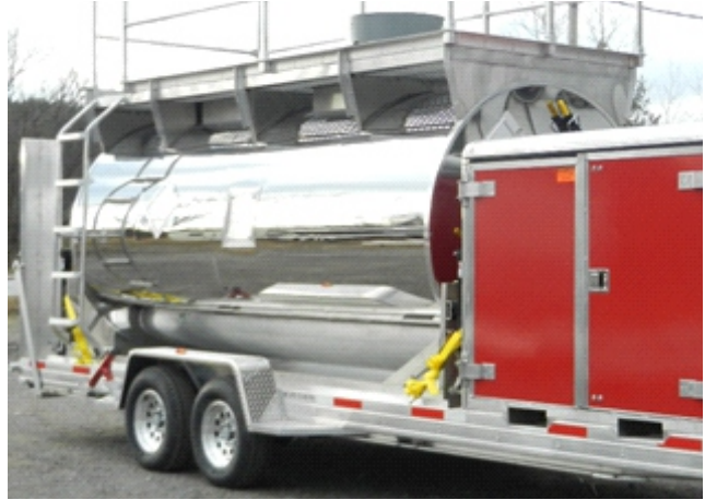
Trainer Sideview with Tank in Standard Position