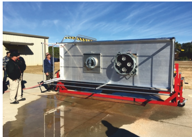
Rollover Tank Simulation