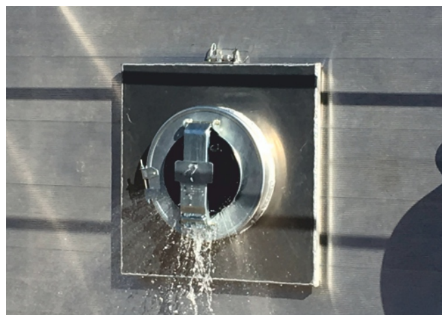
Pressure Relief Valve Leak

©KFT Fire Trainer | All rights reserved | Copying or reproduction in any medium is strictly prohibited. | KFT 20160422 01 DE