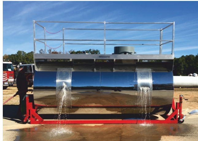
Both Tank Leaks Activated

The currently in use MS-10 HazMat Trainer is useable both on ist trailer truck or in a stationary mode. It features multiple tank leaks, can simulate a tank rollover accident and has both a chlorine and a gasoline dome leak simulator on board.