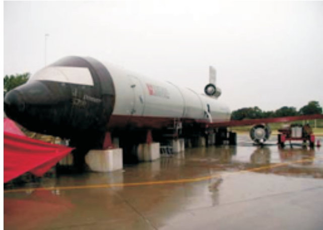
Original CAT6 / B737 Aircraft Trainer