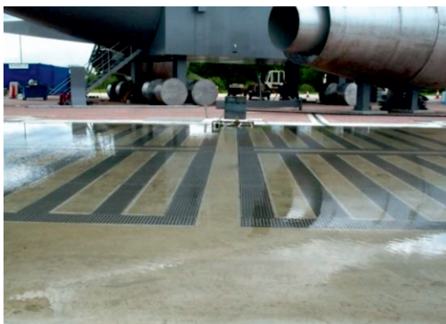
Patented „Drive-on“ Fuel Spill

©KFT Fire Trainer | All rights reserved | Copying or reproduction in any medium is strictly prohibited. | KFT 20160425 01 EN