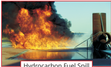
Hydrocarbon Fuel Spill