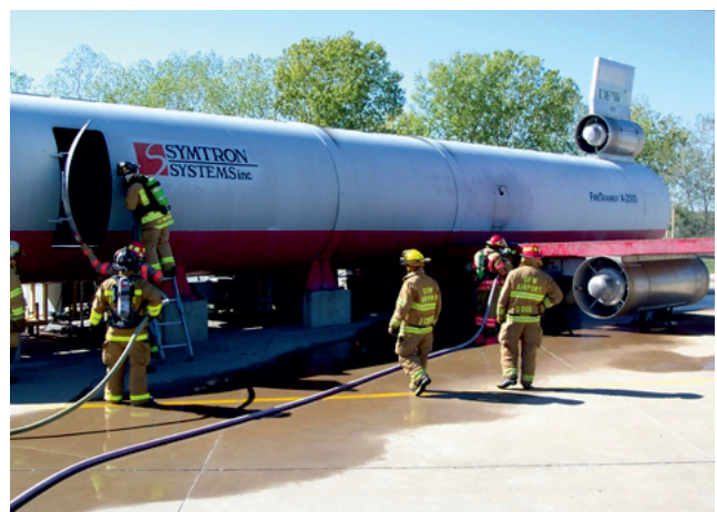
CAT6 / B737 Aircraft Trainer During Training Session

©KFT Fire Trainer | All rights reserved | Copying or reproduction in any medium is strictly prohibited. | KFT 20160425 01 EN