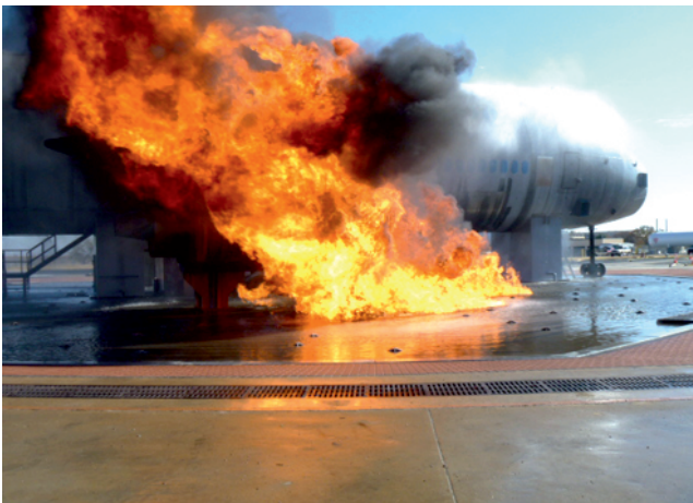
Small Spill Fire