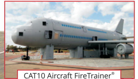
CAT10 Aircraft FireTrainer®