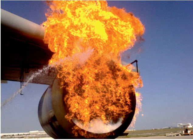
Compressor Engine Fire