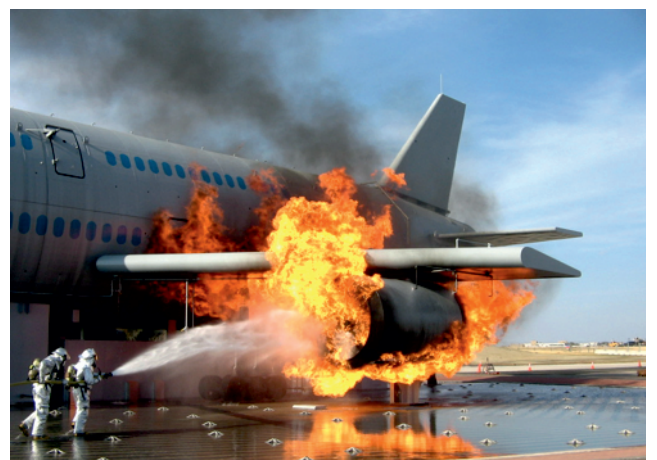
Port Engine Fire Training