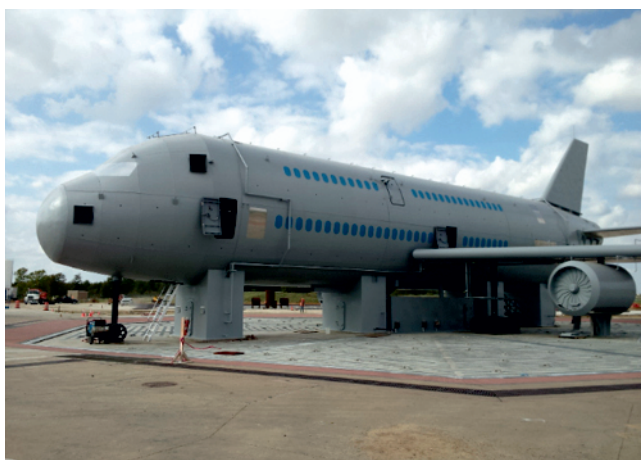
New CAT10 / A380 Aircraft Trainer