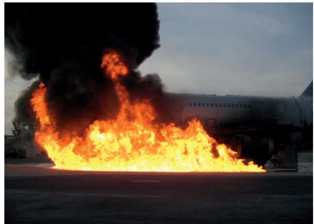
Full Spill Fire