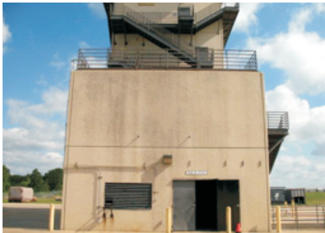
T-2000 Burn House