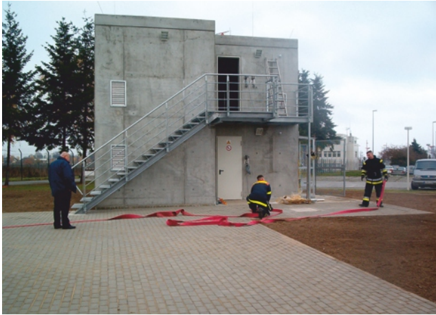
Structural Burn Building