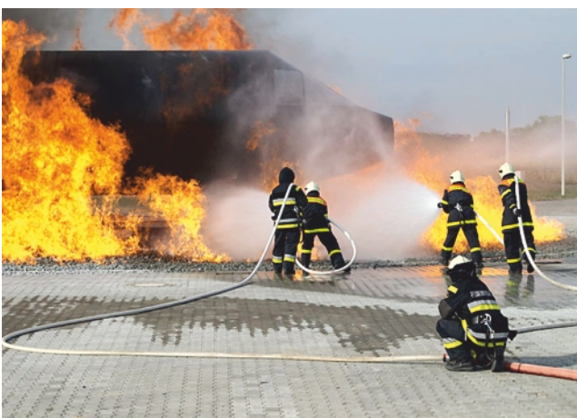
Fuel Spill Fire Training