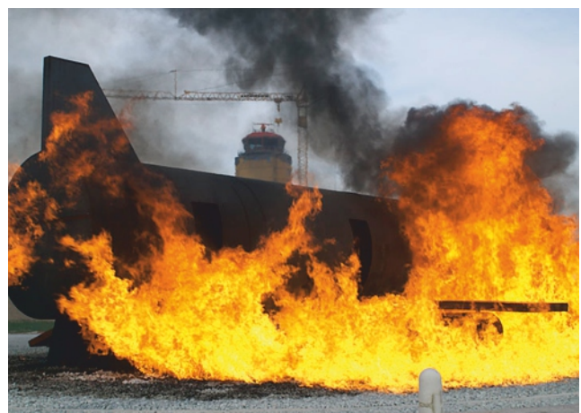
Fuel Spill at Full Height

©KFT Fire Trainer | All rights reserved | Copying or reproduction in any medium is strictly prohibited. | KFT 2017/0202