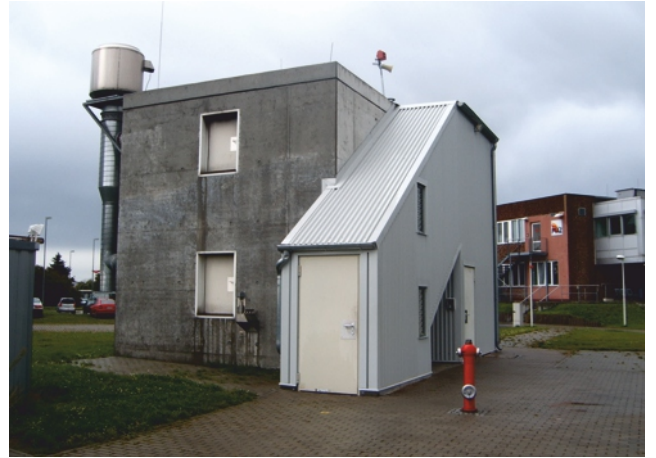
Structural Burn Building with Extension from 2008