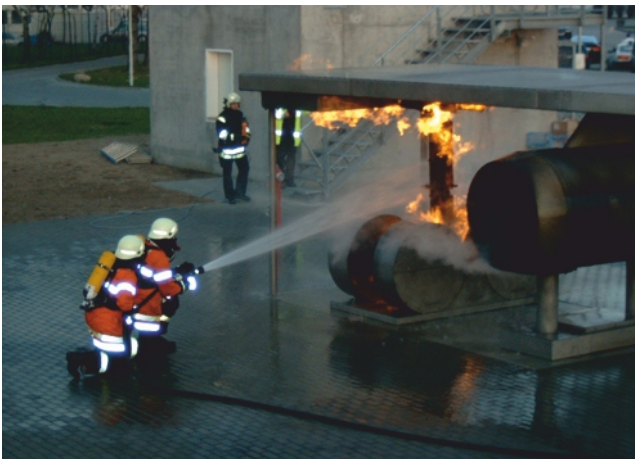
Oleo Strut Fire Training