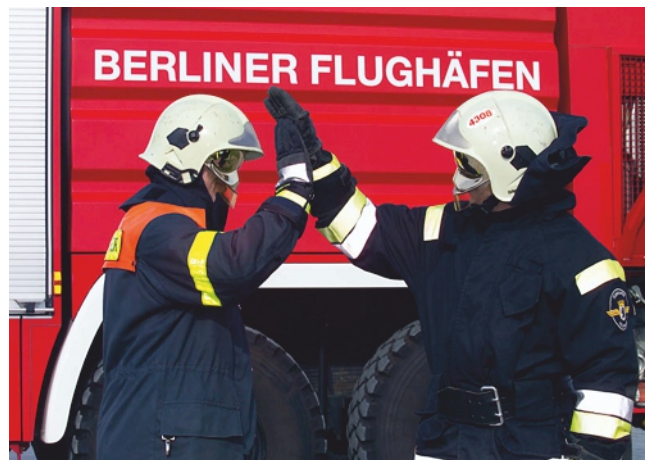
Successful Training Accomplished