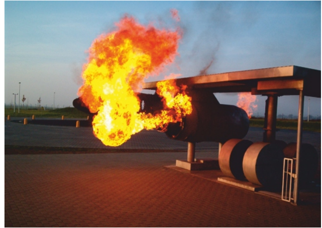
„Hot Flash“ Engine Fire