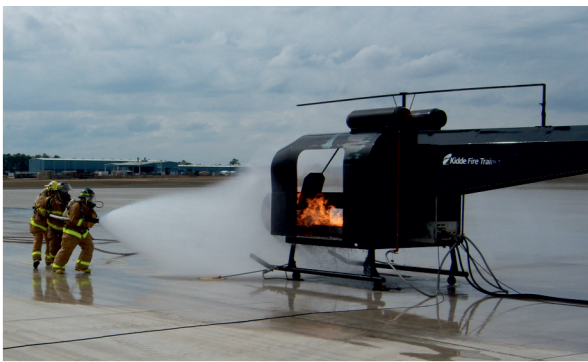
passenger/cargo area fire