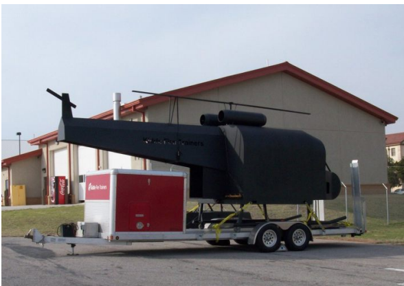
helicopter on trailer with propane tank storage