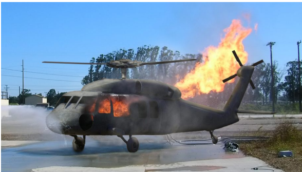
UH-60 Black Hawk and Huey models available