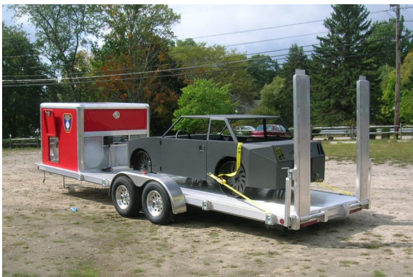
car prop on trailer with propane storage tanks

KFT's Car FIRETRAINER® O-100 is designed for training response personnel in vehicle fire emergencies. KFT's integral multi-zone burner design allows users to simulate numerous vehicle fire scenarios at the push of a button. Additionally, an adjacent Hose Line FIRETRAINER® O-100 (optional) can provide trainees with exposure to simulated leaking fuel fire emergencies. The Car FIRETRAINER® O-100 is extremely versatile, giving users the ability to produce scenarios such as: