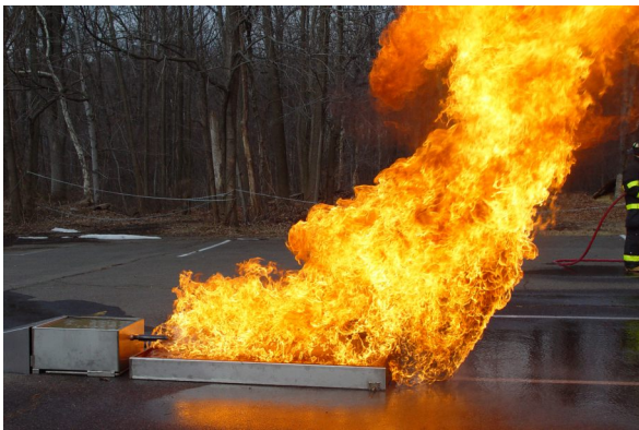
Hose Line FIRETRAINER® O-100