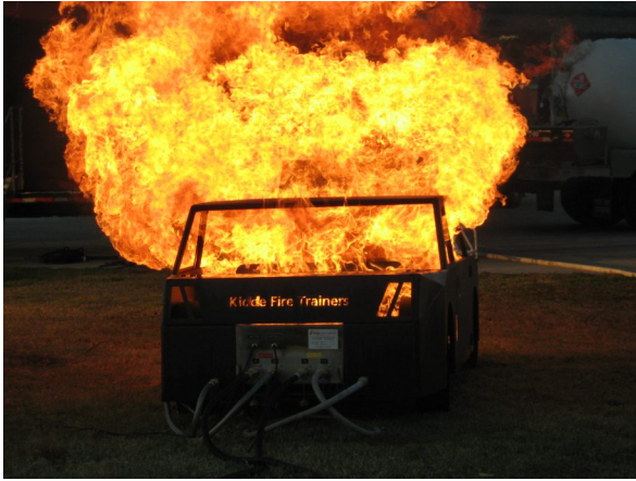
fully involved car fire