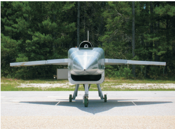
Painted steel construction with removable aluminum nose cone